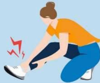
Muscle, bone and joint pain.