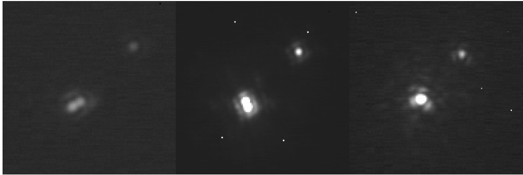
Figure 1. Top: Epoch 05 May 2012 VLBI image of the binary HII 2147 system. Both components are significantly detected. The projected separation between the binary components is 50 milliarcseconds or roughly 6 AU. Bottom: Three epochs of Keck II NIRC2-NGSAO imaging of HII 3197. The system is resolved into a triple and significant orbital motion of the close pair is seen between 2006 (left image), to 2011 (middle image), to 2012 (right image). North is up and East is left in each image. The separation between the close pair and the tertiary is \approx 0.6'' .